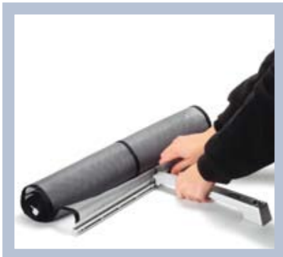
To dismantle, unhook the supporting rod and foot and roll up the brochure holder.