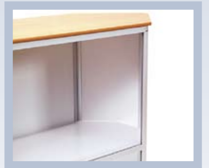
Plenty of room for storing information material.

The Stand Up counter becomes a natural assembly point in an event environment. The perfect place to sign sales contracts! The Stand Up counter comes in two designs. Both are easy to assemble and have stable constructions with maximum exposure surface for your message.