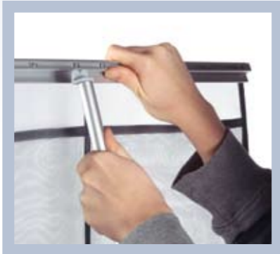
The smart construction of only three parts makes 4 Brochure exceptionally easy to assemble. Choose between four or eight compartments.

4-Brochure comprises of a brochure compartment on transparent fabric. The stand is easily rolled up and transported in a practical and discrete bag. The design is built on the same principle as the 4 Screen display system, highly stable and user-friendly. Weighs only 3.7 lbs.