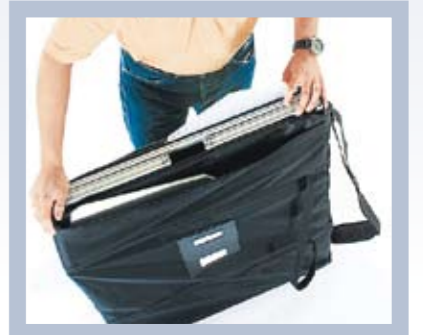
Easy to transport and mount. All the panels are already in place in the system.