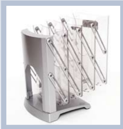
The brochure stand folds and unfolds like an accordion.