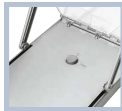
The locking button secures the system when unfolded.