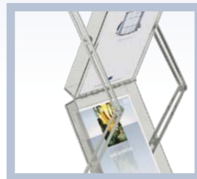
360° brochure exposure.

"The new Brochure Stand" exposes your brochures in two directions thanks to the zig zag construction. The brochure stand unfolds by gripping the top and lifting it to upright position. The stand has a sleek design and stands steady. A locking button makes the system secured when unfolded. Available in a hard or soft transport case.