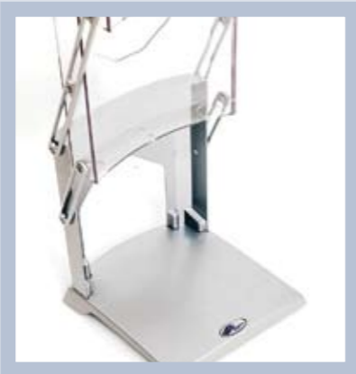
Designed to be both sleek and stable.